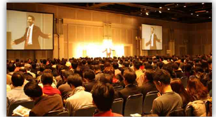
Asia's #1 Success Coach speaks to crowd of 700 people