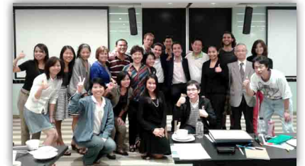
7-day NLP Certification Practitioner Course in Bangkok, 2011